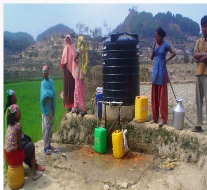
SAFE DRINKING WATER