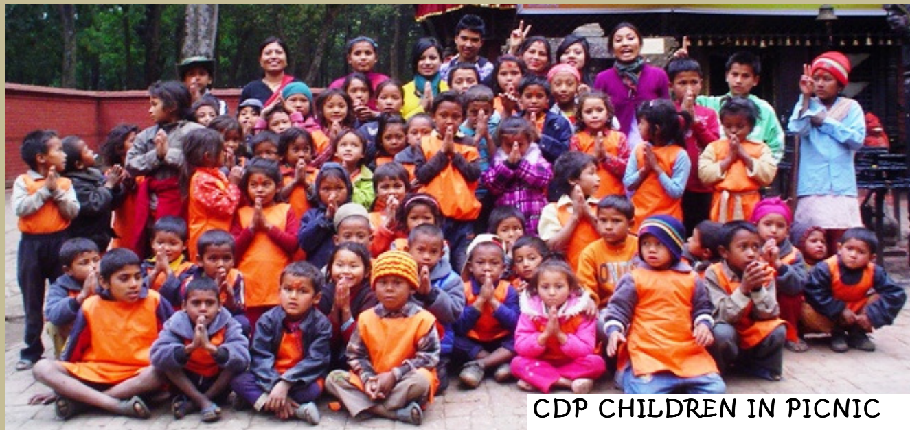
CDP CHILDREN IN PICNIC