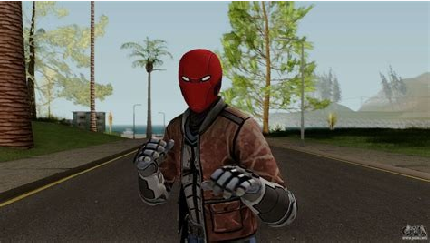
How to say yes in gta san andreas ps2. How to get at 400 in gta san andreas. How to interact in gta san andreas. How to lose money gta san andreas.