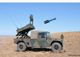
Meaning of anti tank missile. Spike anti tank guided missile upsc. Anti tank guided missile range. Man portable anti tank guided missile upsc. Best anti tank guided missile in the world. List of anti-tank guided missiles.