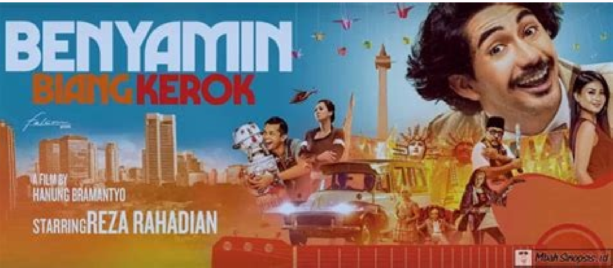
Film benyamin biang kerok 1972 full movie. Download film benyamin biang kerok (1972 full movie). Nonton film benyamin biang kerok 1972 full movie.