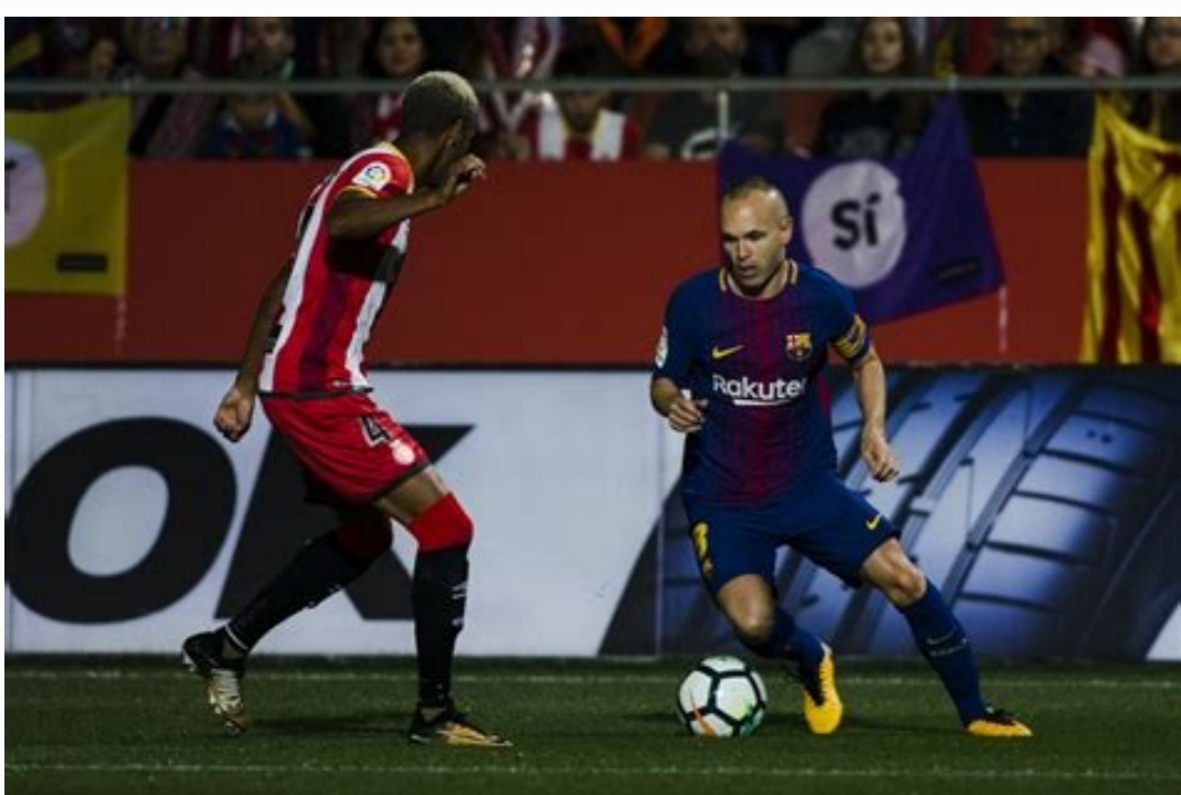
Barca squad in 2010.