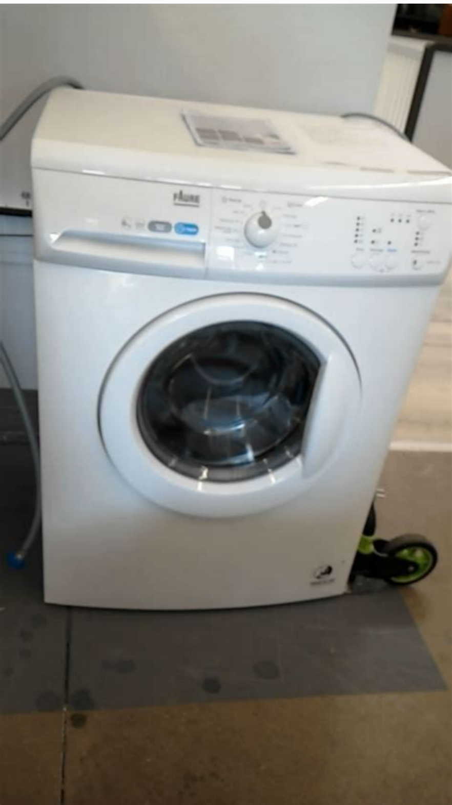
Notice machine a laver faure 6kg 1200 tours. Washing machine with spinner price in pakistan.